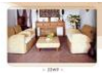
Furniture from Water Hyacinth Root